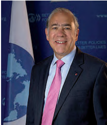
Angel Gurría Secretary-General