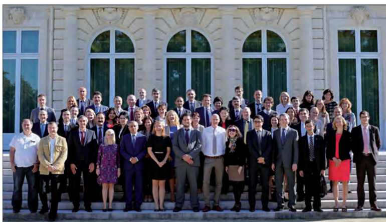
Participants of the ACN Plenary Meeting, Paris, September 2013